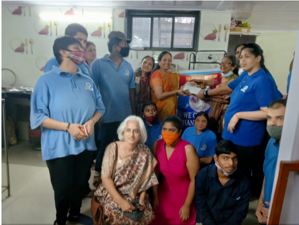
We club and angels – Pantry sponsors