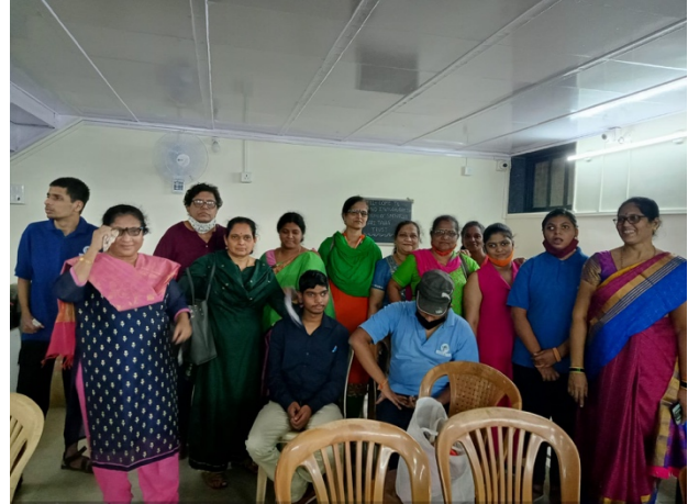
Parents of students