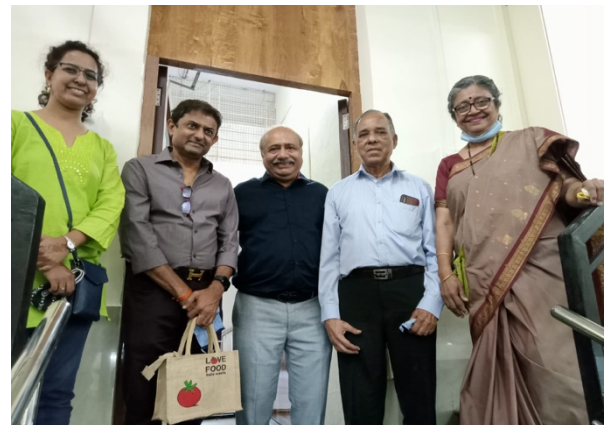
Our main sponsors