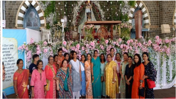
Parents at Mount Mary