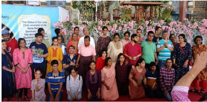
Children and staff at Mount Mary