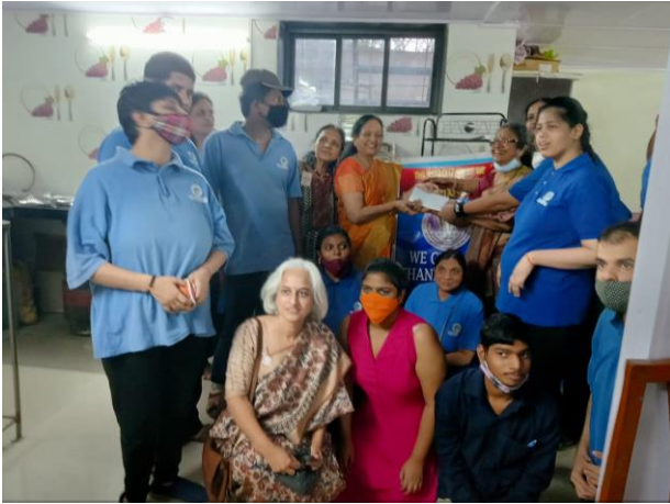
We club and angels – Pantry sponsors