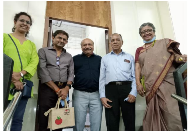
Our main sponsors