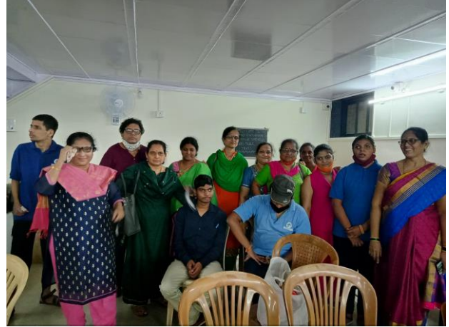
Parents of students